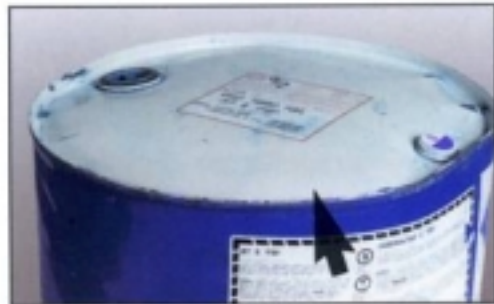
No bulged heads or bottoms extending beyond chimes.