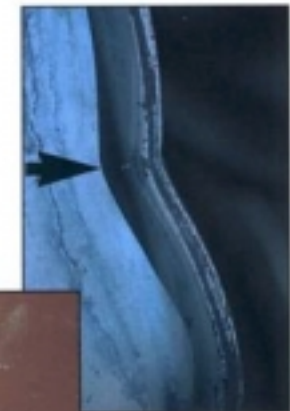
Bent, creased, or folded chimes are ineligible (slightly out-of-round chimes are eligible).