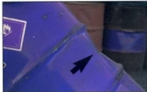
Deep dents in excess of 5 cm (2 in.) are ineligible.