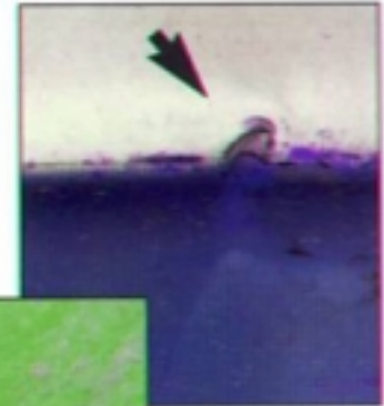
Dented, creased, or flattened rolling rings are ineligible.